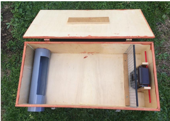
Figure 1. The inside of the Mostela, comprising tunnel and trail camera (above) and the Mostela in a closed position for deployment in the field (below).

**Denotes number of unique detections. If multiple consecutive videos were recorded of an animal at the same time, this is classed as one detection.