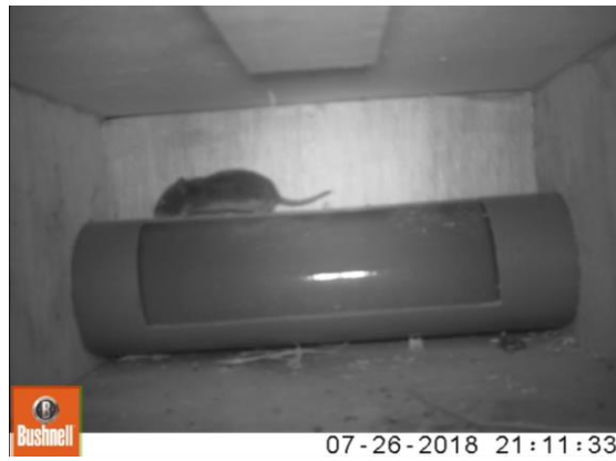
(d) Bank vole