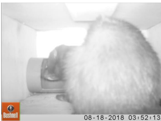
(e) American mink