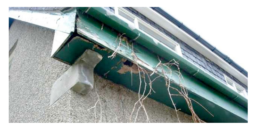
Photo: A potential access hole for a marten in a rotten soffit © Hugh Brown

2. Ensuring good house maintenance. Many cases of martens occupying houses (or other buildings) could easily have been prevented if the building fabric had been properly maintained. Pine martens are expert climbers and can climb up walls with no difficulty whatsoever. A favourite access point is through enlarged gaps in rotten soffits (see photo). Smaller gaps than 50mm can often be enlarged.