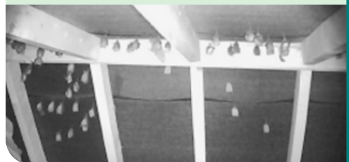
Photo: A still shot from our camera at the bat roost

If you would like to view the inhabitants of our premier lesser horseshoe bat roost click here . Happy viewing!