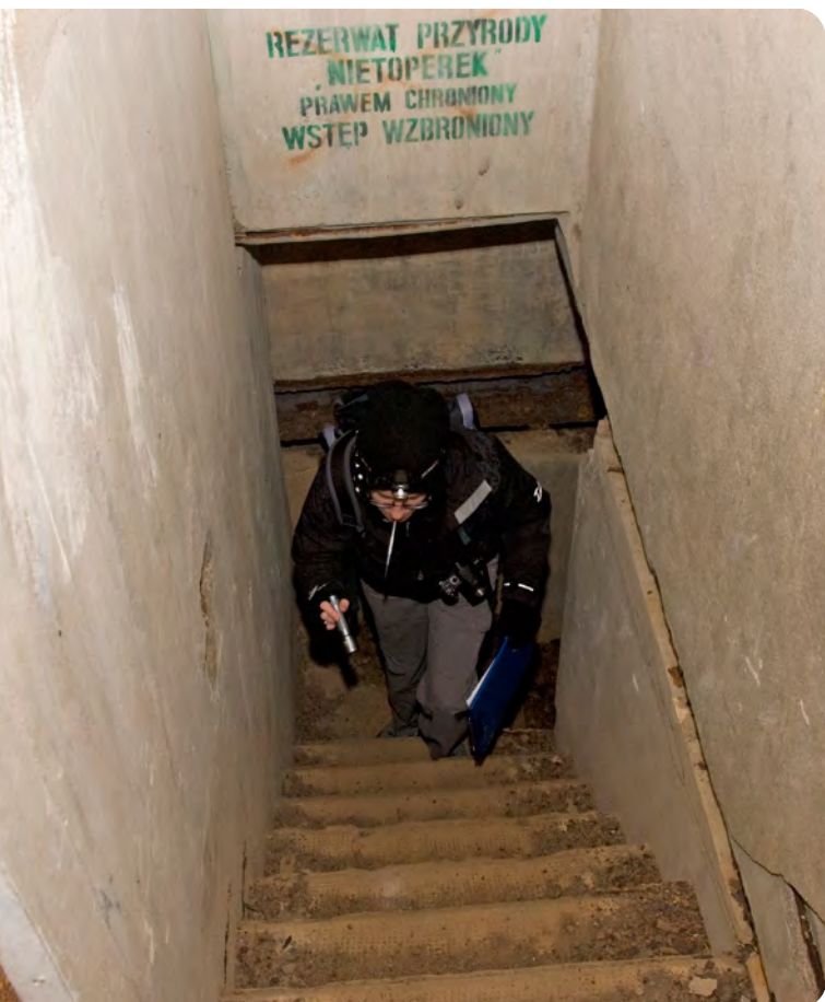
Photo: Checking for marten scats on the stairs leading up to the bunkers

The initial results are showing that both pine and stone martens are active in the system and contrary to our initial feelings they are active all year around, even in the summer when the bats are not in residence and there can be little food available.