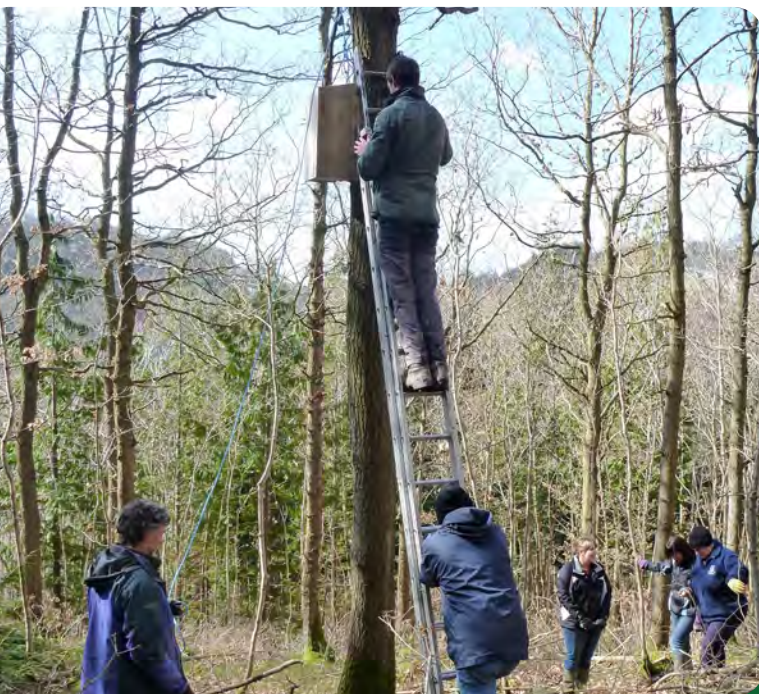
Photo: Erecting pine marten den boxes

The main objective of the habitat improvement work involves installing den boxes, which compensate for the lack of appropriate tree cavities that martens require for safe resting sites and breeding. We have so far installed 59 boxes! The idea is to create a 'stepping stone' network between the two hotspot sites of Brechfa and Maentwrog, which have been identified from sightings over the years as the most likely areas of persistence.