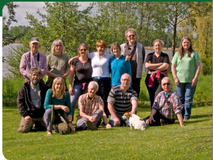
Photo: Scat team photograph at Nietoperek in May

The study is focused in and around Nietoperek, the largest hibernation site for bats in northern Europe. Nietoperek consists of 32km of underground railway tunnels and the remains of Second World War fortifications on the surface. The study aims to use non-invasive genetic techniques to build up a picture of the activity of individual martens at the site: where they have their territories, which times of the year they are active in the system and what species of bats they are eating.