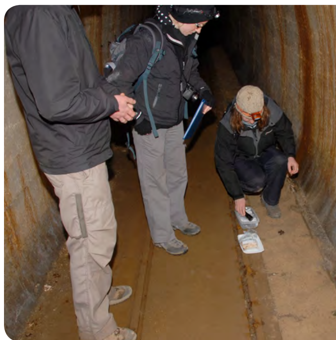
Photo: Collecting marten scats in the tunnels