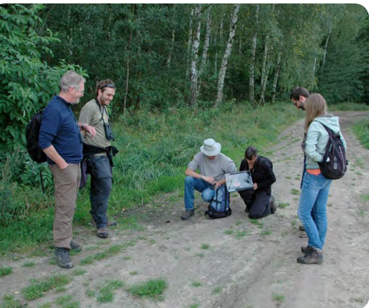
Photo: Surveying tracks for scats

The techniques for identifying individual animals are still being developed, but we know from the initial analysis that we are not simply dealing with one or two animals that have learned about this seasonal food resource. Data from the species, sex and haplotype indicate that there are at least eight animals in the system, but when the individuals have been identified it is likely there will be many more.