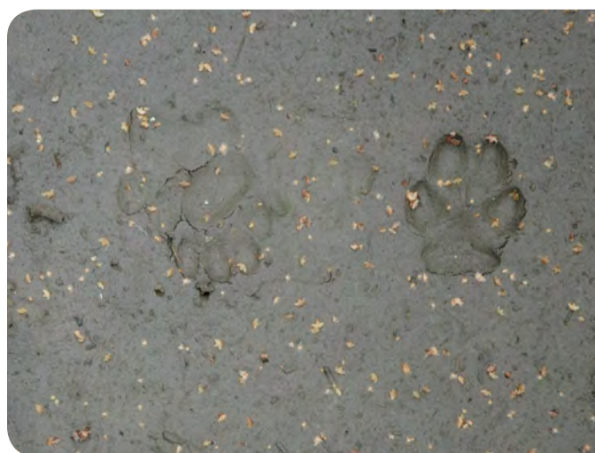
Photo: Marten tracks in the mud

We also know that the martens are actively hunting the bats rather than simply scavenging dead or moribund animals on the tunnel floors. Tell-tale scratch marks and paw prints show they are climbing up the tunnel walls to reach the torpid bats, using anything that will give them purchase. This is quite remarkable as they are doing this in complete darkness many hundreds of metres from the surface and probably using their sense of smell, or maybe hearing, to detect the presence of the bats.