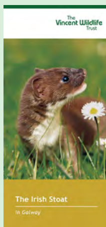
Photo: Cover of our new stoat leaflet