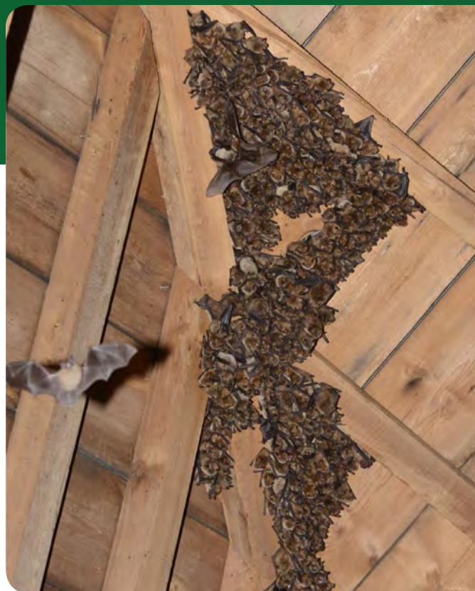
Photo: The largest colony of Geoffroy's bats ever discovered in Flanders

Bat number three was found by one of the Belgian bat workers who had hired a small plane: although expensive at 100 Euros an hour, it can be a very cost-effective way of finding a bat species that can fly many km per night. The bat was discovered in less than an hour, over 20km from where it was originally