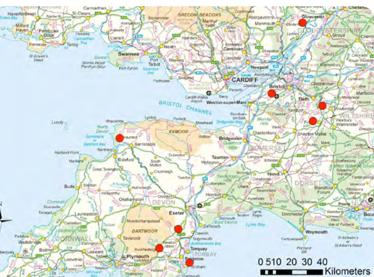
Map: Location of greater horseshoe bat roosts studied this summer

The data sets for all of these surveys have been huge and analysing the data is very time consuming, even with automated software. Advancements in the software we have been using continue, and each time there is an advancement the original data are re-processed. Eventually, the results should show us how street lighting is affecting the behaviour of horseshoe bats.