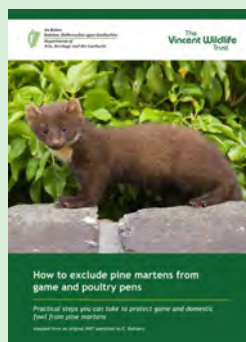
Photo: Cover of our new leaflet ' How to exclude pine martens from game and poultry pens '