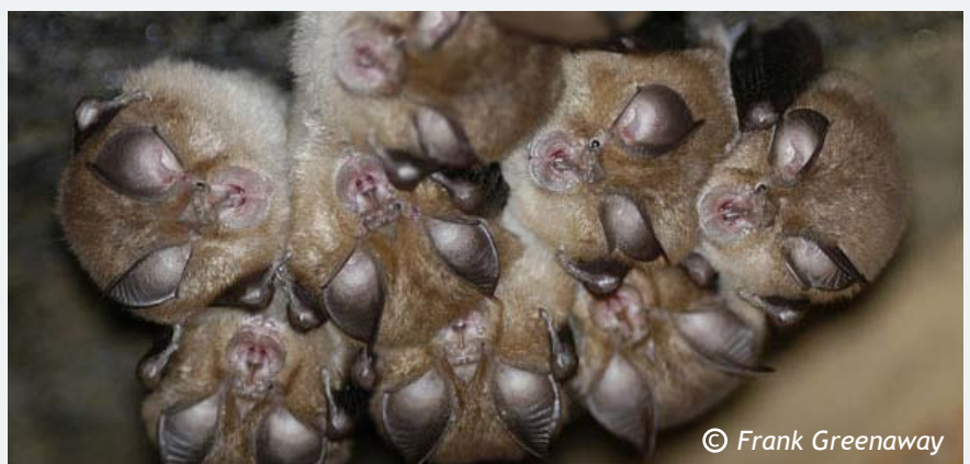
Fig.15: Group of adult females clustered together in maternity roost

By November, the majority of lesser horseshoe bats will have left their summer breeding sites to seek refuge from the frost in their hibernation roosts.