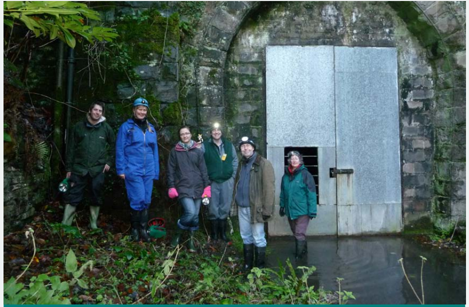
Fig. 17: Surveyers at a hibernation site in the Usk Valley

A separate ice house nearby had 51 lesser horseshoe bats, another record count which reflects the continuing success of this site which was used by only one bat before the VWT restored the building in 2007. Another two of the Trust's local reserves were home to 26 and 27 hibernating lesser horseshoe bats respectively.