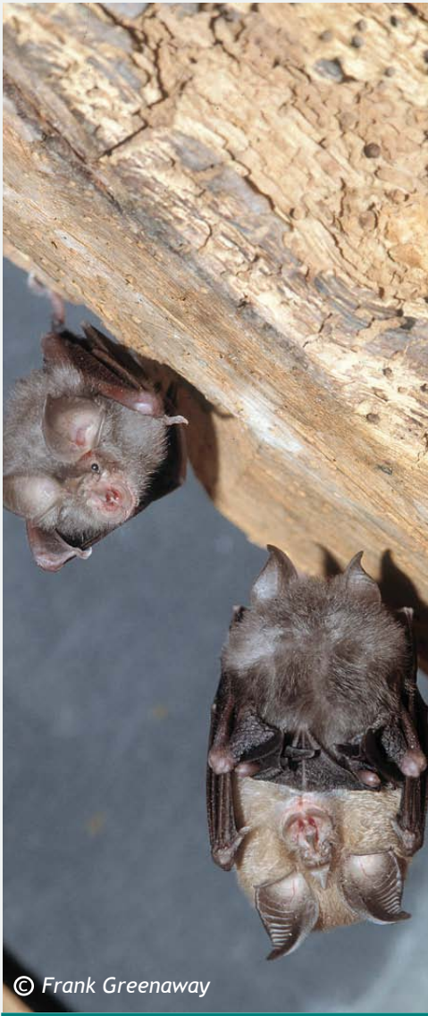
Fig.14: Pale buff coloured adult female with grey coloured young bat

By Jane Sedgely, Project Officer Our Beacon for Bats