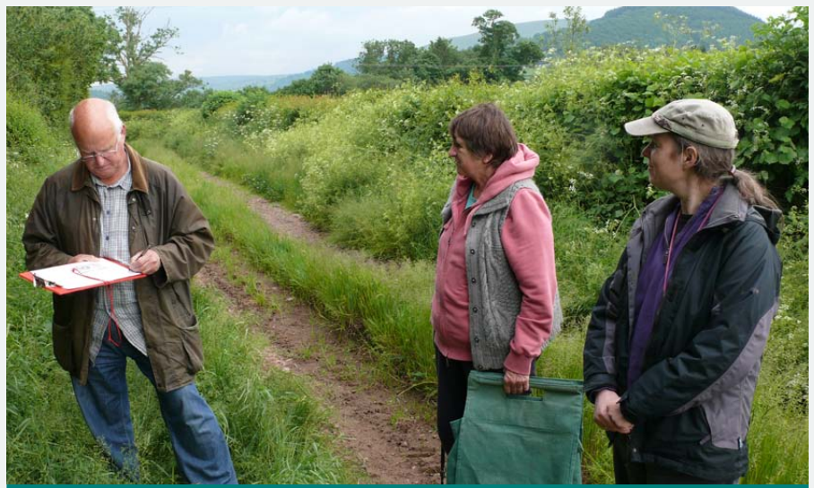
Fig.11: 'The Chaps' at work describing hedgerows and habitats

A detailed record of various features at each location was kept, together with digital photographs and a 12 figure grid