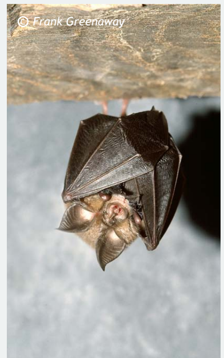
Fig.2: Lesser horseshoe bat

Lesser horseshoe bats, along with good numbers of more common bat species, such as Daubenton's bat, common and soprano pipistrelles, and Natterer's bats, were found throughout. Information from these surveys is already being used to inform roadside and towpath management helping to ensure green corridors are maintained and so enable the bats to move between their roost sites and foraging areas.