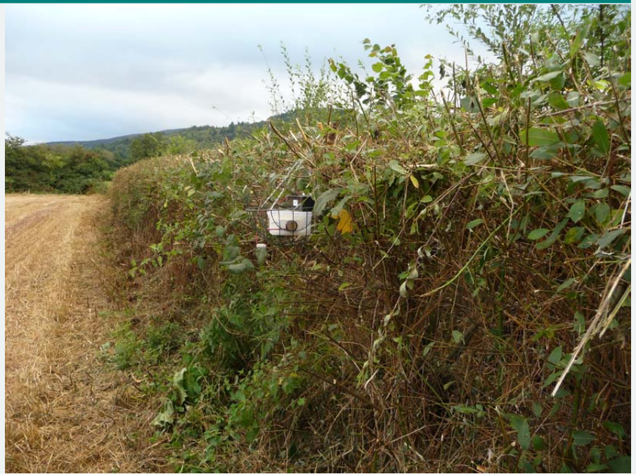
Fig.12: Anabat detector cleverly positioned in its hanging basket and waterproof box

At times it was a ‘love hate’ relationship with the Anabats when, for example, they were not connected to a fully charged battery, or when we forgot to check the sensitivity level and ended up recording every single drop of rain over a two night period.